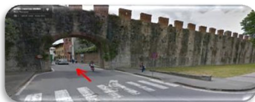
Porta di San Ranierino (San Ranierino's Gate)

As soon as you reach Via Contessa Matilde, you can enter the historical centre through the Porta di SAN RANIERINO (San Ranierino's Gate). This access is controlled by a video camera and you are ALLOWED to enter in order to reach our hotel. We will then take care of communicating your plate number to the Traffic Police Headquarters so as to confirm your permission to enter in the Northern Traffic Restricted Area (ZTL NORD).