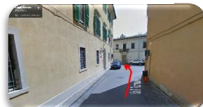
Via San Tommaso

This street will lead you to compulsorily turn left into VIA CAPPONI , from where you'll end up in VIA SAN GIUSEPPE