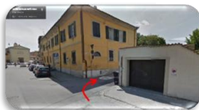
Per via San Tommaso

You'll find yourself in the one-way street VIA CARDINALE MAFFI , and, almost at the end of this street, you need to turn right into Via SAN TOMMASO