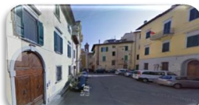
Via San Giuseppe and then Via S. Apollonia

Drive along this one-way street until its end, and, after about 300 meters (about 1000 feet), by turning right, you'll be in Via S. Apollonia . Drive only a few meters farther and you've reached the hotel!